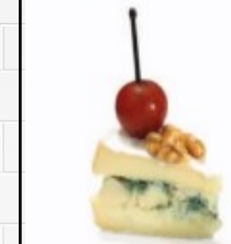
Torte Pick Camembert Cheese, Gorgonzola Cheese, Walnut, Red Grape