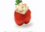
Peppadew® Bite Peppadew®, Garden Vegetable Cheese Spread, Parsley Garnish