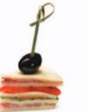
Rustica Pick Mild Provolone Cheese, Salami, Pepparoni, Basil, Roasted Red Pepper, Pitted Kalamata Garnish