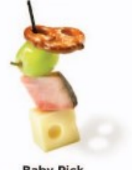
Baby Pick Baby Swiss Cheese Cube, Ham Chunk, Green Grape, Topped with a Pretzel Knot