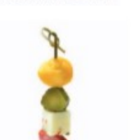
Deli Pick Sausage, Pepper Jack Cheese, Sweet Pickle, Cheddar Cheese Curd or Cube