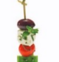
Greek Salad Pick Cucumber Chunk, Grape Tomato, Feta Cheese Cube, Pitted Kalamata, Olive Oil Drizzle, Oregano Garnish