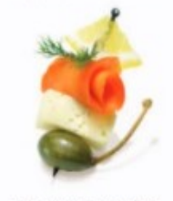
Smorg-More Pick Caper Berry, Dill Havarti Cheese, Lox/Cured Salmon, Baby Dill, Lemon Wedge Garnish