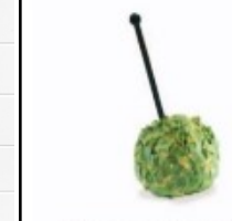
Cheese Truffle Pick Cold Pack Cheese, Dried Chives