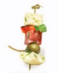
Antipasti Pick Artichoke, Caper Berry, Salami Chunk, Red Pepper, Parsley Garnish, Sharp Provolone Cheese, Olive Oil