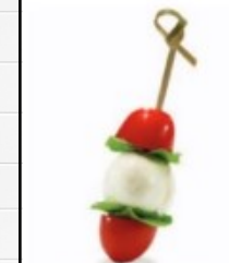
Caprese Pick Grape Tomato, Basil Leaf, Fresh Mozzarella Cheese Ciligene