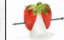
Brie Berry Pick Mini Brie Cheese Wedge, Strawberry