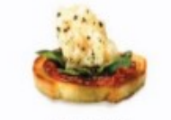
Roman Bite Bread Coin, Oil Cured Tomato, Oregano, Romano Cheese Chunk, Cracked Black Pepper, Olive Oil Drizzle